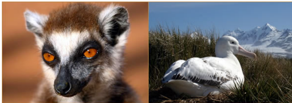
Magical Madagascar's Ring-tailed Lemur and Wandering Albatross

This year has flown by at hummingbird pace and we are still reveling in the many remarkable bird and wildlife sightings and unforgettable memories of times enjoyed with birding friends that this year has brought! As you read through the newsletter below you will learn of some of these and indeed of the numerous adventures planned to see out this action packed year including several explorations of magical Madagascar and our private charter to the icy land of Antarctica! This, combined with an extraordinary portfolio of exciting upcoming 2009 destinations, ensures that there is a wealth of unbeatable Rockjumper birding adventures for you to choose from in the months ahead!