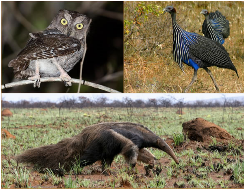
Totoroka Scops Owl (Left) Vulturine Guinea fowl (Right) and Giant Anteater (Bottom)

The great birding success of our tours and commitment of our tour leaders are well known in the international birding community, but rather than elaborate with mere adjectives let us mention some of our recent tour highlights and travels: