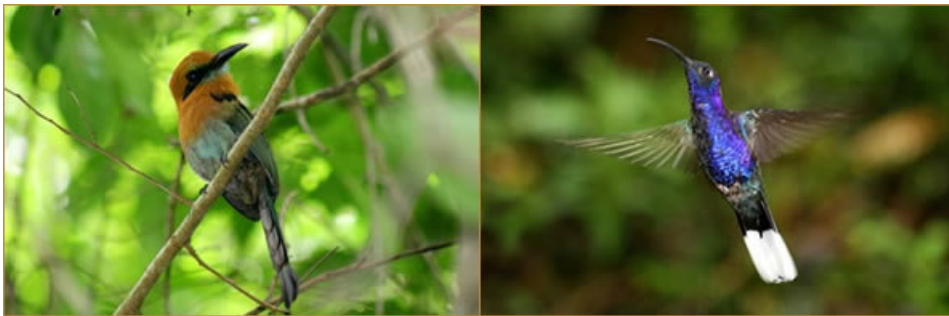
Broad-billed Motmot and Violet Sabrewing by D. Shackelford.

Rockjumper Birding Tours' debut adventure through the Isthmus of Panama led by David Shackelford was a smashing success with nearly four hundred bird species encountered plus a close look into the fascinating workings of the historic Panama Canal. We began our explorations of the central lowlands along the famous Pipeline Road where gaudy Blue Cotinga, Spotted Antbird and roosting Spectacled Owl vied for our attention among a cacophony of parrots, toucans, and primates. The western Chiriqui highlands invited us into cooler cloud forest habitats where colorful Golden-browed Chlorophonia, Costa Rican Pygmy-Owl, Fiery-billed Aracari, and active Violet Sabrewing were overshadowed only by scope views of the incredible male Resplendent Quetzal. We concluded in the quaint foothills of El Valle where Brown-throated Two-toed Sloth amused us near our rainforest resort while surrounded by excellent birding including the tiny Tody Motmot, Rufous-crested Coquette, and vocal Rosy Thrush-Tanager. We look forward to future birding travels through this fascinating country as well as continuing our next tour into the biodiverse eastern lowlands of the Darien!