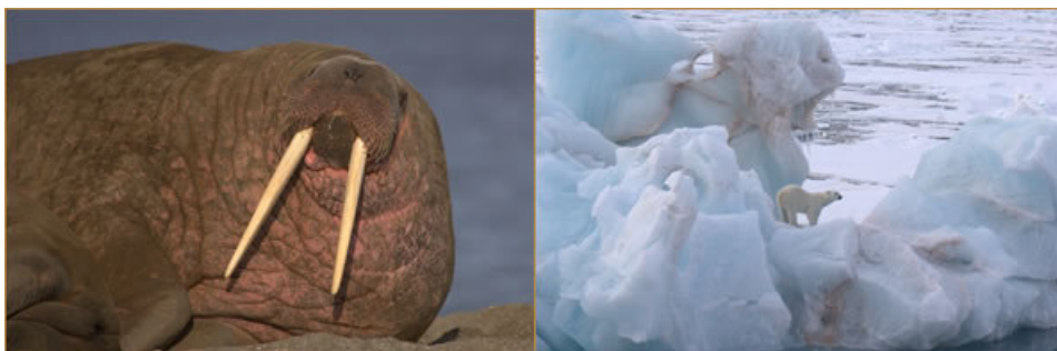
Spitsbergen delights! Walrus and Polar Bear by A. Riley.

Spitsbergen Land of Arctic Dreams: 26 Jun — 6 Jul (11 days) Standard cabins US$6,525 pp