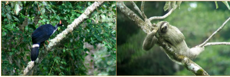
Horned Guan and lazing Three-toed Sloth