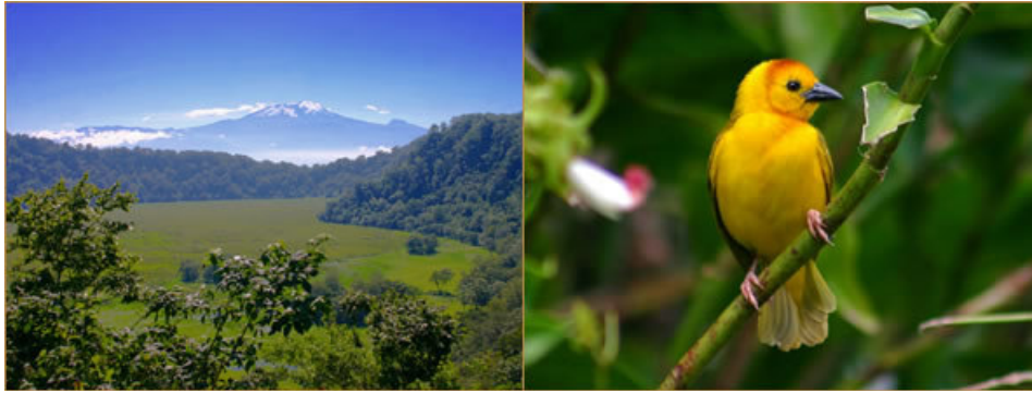
Arusha National Park and Tavetta Golden Weaver by D. Shackelford.

Two of our latest tours through the wildlife rich nation of Tanzania led by Cuan Rush and Markus Lilje produced some incredible sightings from the famous Serengeti to the islands of Pemba and Zanzibar. A few of the many bird highlights included the endemic Grey-breasted Spurfowl, thousands of Lesser Flamingos at Lake Manyara, Fischer's and Yellow-collared Lovebirds, White-headed Mousebird, Narina Trogon, the East African endemic Grey-crested Helmetshrike, Rosy-patched Bushshrike, Red-throated Tit, the critically endangered Beesley's Lark, African Broadbill, the seldom seen Sharpe's Starling, Tavetta Golden Weaver, Golden-winged Sunbird, Red-throated Twinspot, Mangrove Kingfisher and Grey-headed Silverbill. Mammals were also outstanding with great sightings of five species of cats including a lioness killing a Burchell's Zebra, Guereza Colobus, Spotted Hyena, the elegant Serval, two magnificent Leopards, Cheetah with a young cub, large numbers of African Elephant and African Buffalo, the vast Blue Wildebeest migration, bizarre Gerenuk, and the incredible Zanzibar Red Colobus. The combination of all these birds, incredible wildlife, super lodgings and fantastic food make this region one of the finest travel experiences in Africa!