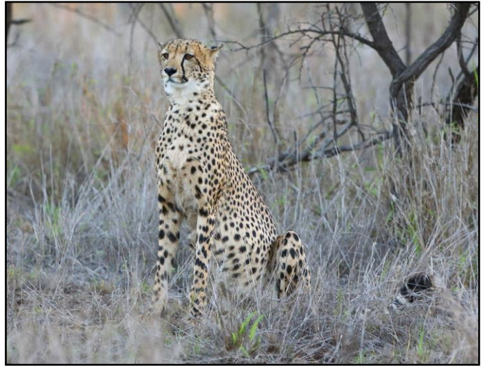
Cheetah by Adam Riley

which we will have plenty of time to explore. This reserve is drier on the whole than neighboring Tsavo West with large open flat plains that are excellent for species such as Somali Ostrich, Secretarybird, elegant Pallid and Montagu's Harriers, Buff-crested, Kori and White-bellied Bustards, Black-headed Lapwing, Northern Carmine and Somali Bee-eaters, Red-winged and Pink-breasted Larks, Ashy Cisticola, Rosy-patched Bushshrike, Long-tailed and Taita Fiscals, Black-faced Sandgrouse and Cut-throat Finch. Tonight, we will stay in the Voi area on the western edge of Tsavo East where species such as Western Barn Owl and Nubian and Slender-tailed Nightjars are sometimes seen.