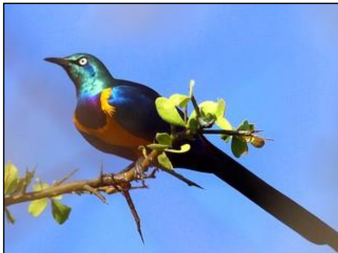
Golden-breasted Starling