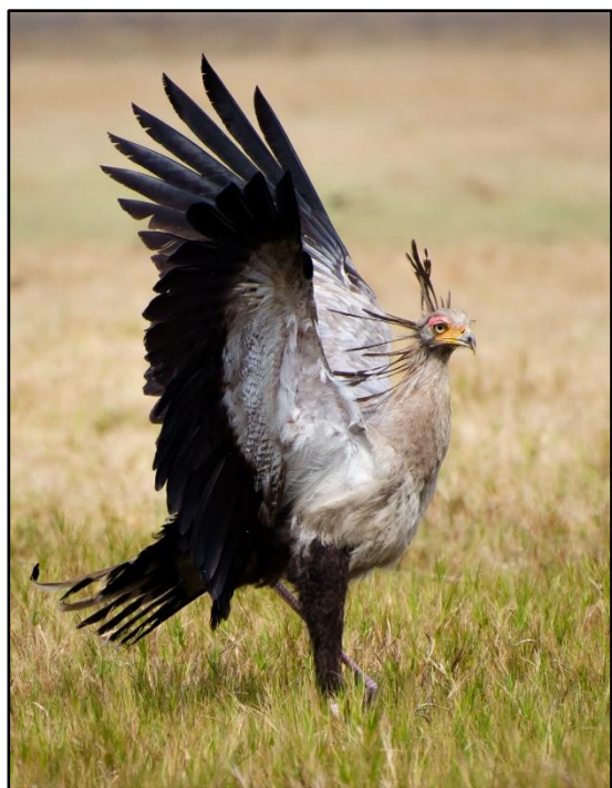
Secretarybird

Day 3: Tsavo West to Tsavo East. After breakfast this morning we depart Tsavo West and head across to neighboring Tsavo East. Mammals will be a feature of our drive and we could well see Lion (these descended from the famous "man-eaters of Tsavo"), Cheetah, Leopard, African Buffalo, Lesser Kudu, Maasai Giraffe and Plains Zebra. The Tsavo complex is home to the largest population of African Elephant in Kenya (said to number over 7000) and a small population of Black Rhinoceros. We then continue on our drive to Tsavo East where we will have an opportunity to check into our lodge and then in the afternoon enjoy a game drive. The latter part of the afternoon is often extremely productive from both a birding and mammal watching point of view and we can definitely expect to see something special.