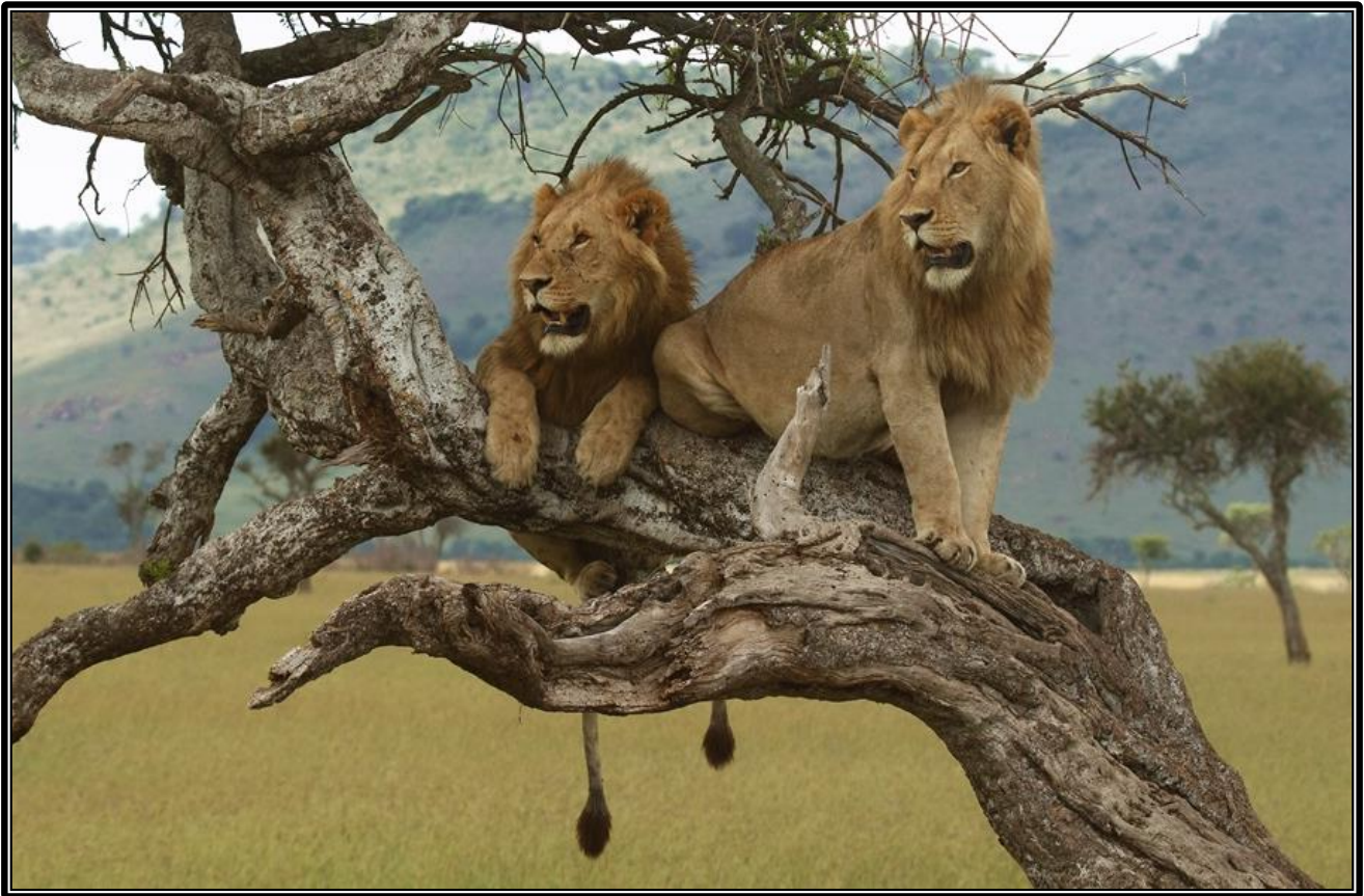
Male Lions

On this extension we focus our time on the exceptional Tsavo reserves which hold a wonderful assortment of dry country species and a plethora of big game including more opportunities to see a variety of antelope species, African Elephant and Big Cats such as Lion, Leopard and Cheetah. On the birding front the list of quality species is numerous and includes Scaly Chatterer, Red-naped Bushshrike, Pringle's Puffback, Tsavo Sunbird, Taveta Weaver, Golden-breasted and Fischer's Starlings, White-throated Robin, the rare and little known Friedmann's Lark, Hartlaub's Bustard and Grey-headed