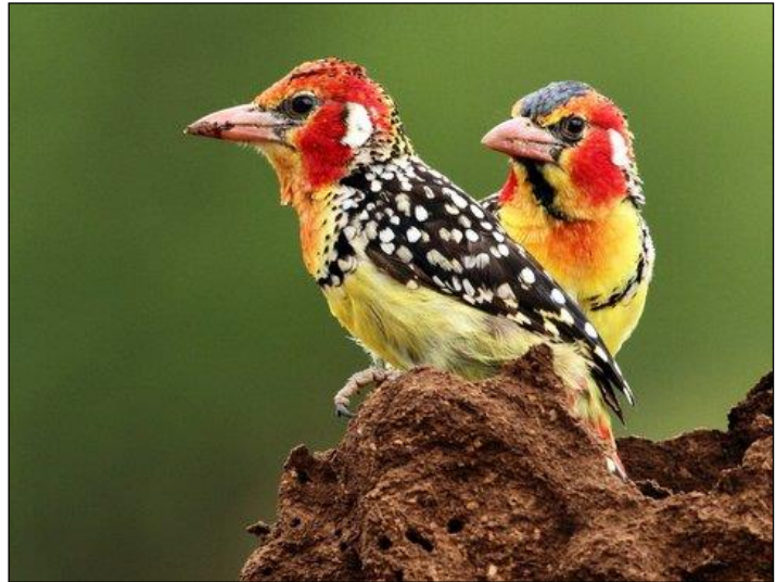
Red-and-yellow Barbets

Day 1: Nairobi to Tsavo West National Park. This morning we depart Nairobi and head out east for the world-famous Tsavo National Parks. Both Tsavo East and Tsavo West hold fantastic numbers of big game and we will enjoy a total of 4 nights (2 nights in each reserve), where we will enjoy multiple game drives looking for the region's special birds and animals. Tsavo West protects over 9000 square kms of habitat with major focal points including Mzima Springs, the beautiful Tsavo River and Lake Jipe on the border of Tanzania.