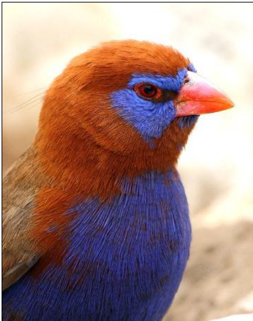
Purple Grenadier by Markus Lilje

The dry country of Tsavo East holds a huge variety of species and we have a full day set aside to explore the reserves wonderful variety of habitat. Raptors are often a major feature and we will look for Egyptian, Hooded, White-headed, White-backed, Rüppell's and Lappet-faced Vultures, African Cuckoo-Hawk, Black-chested and Brown Snake Eagles, African Hawk-Eagle, Eastern Chanting Goshawk, migrating Steppe and Lesser Spotted Eagles, the majestic Bateleur, Pygmy Falcon and Eurasian Hobby. Other potential ticks include Emerald-spotted Wood Dove, Little, White-throated, Blue-cheeked, Olive and European Bee-eaters, Lilac-breasted, Purple and European Rollers, Abyssinian Scimitarbill, Northern Red-billed and Von der Decken's Hornbills, Nubian, Bearded and Cardinal Woodpeckers, Greater and Lesser Honeyguides, D'Arnaud's, Red-and-yellow Barbet, Flappet Lark, and Chestnut-headed and Chestnut-backed Sparrow-Larks.