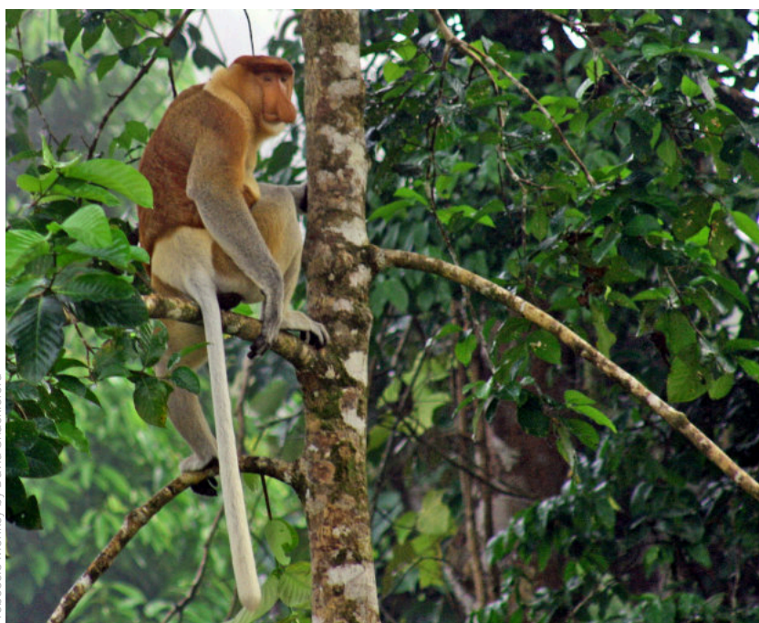
Proboscis Monkey

DAY 5: Kinabatangan River and depart for Sandakan for a connecting flight to Kota Kinabalu. Superb rainforest birding is to be had during our final morning along the Kinabatangan River. The surrounding area has unfortunately been reduced to endless tracts of commercial Oil Palm plantations with the result that nearly all the region's wildlife has been forced into a narrow strip of forest along the river. We have several more hours this morning to explore the Kinabatangan River and the surrounding rainforest by boat, following which we will depart for Sandakan where we will catch our connecting flight back to Kota Kinabalu where our tour will come to an end.