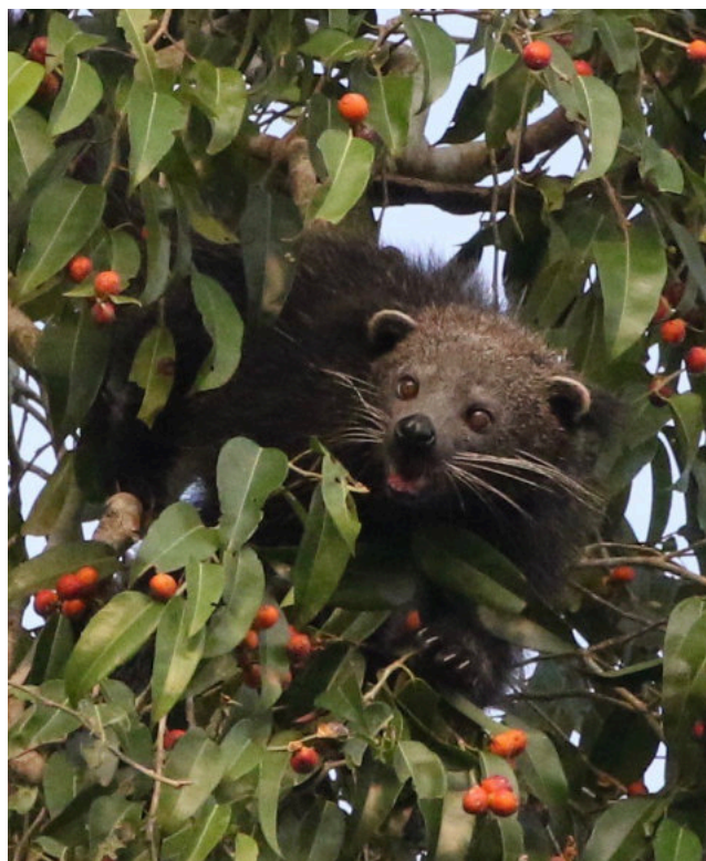
Binturong

Falconet, Wallace's Hawk-Eagle, Jerdon's Baza, Mustached Hawk-Cuckoo, Long-tailed Parakeet, the very rare and until recently mythical Bornean Ground Cuckoo, Flat-headed Cat, Maroon Langur and Southern Pig-tailed Macaque.