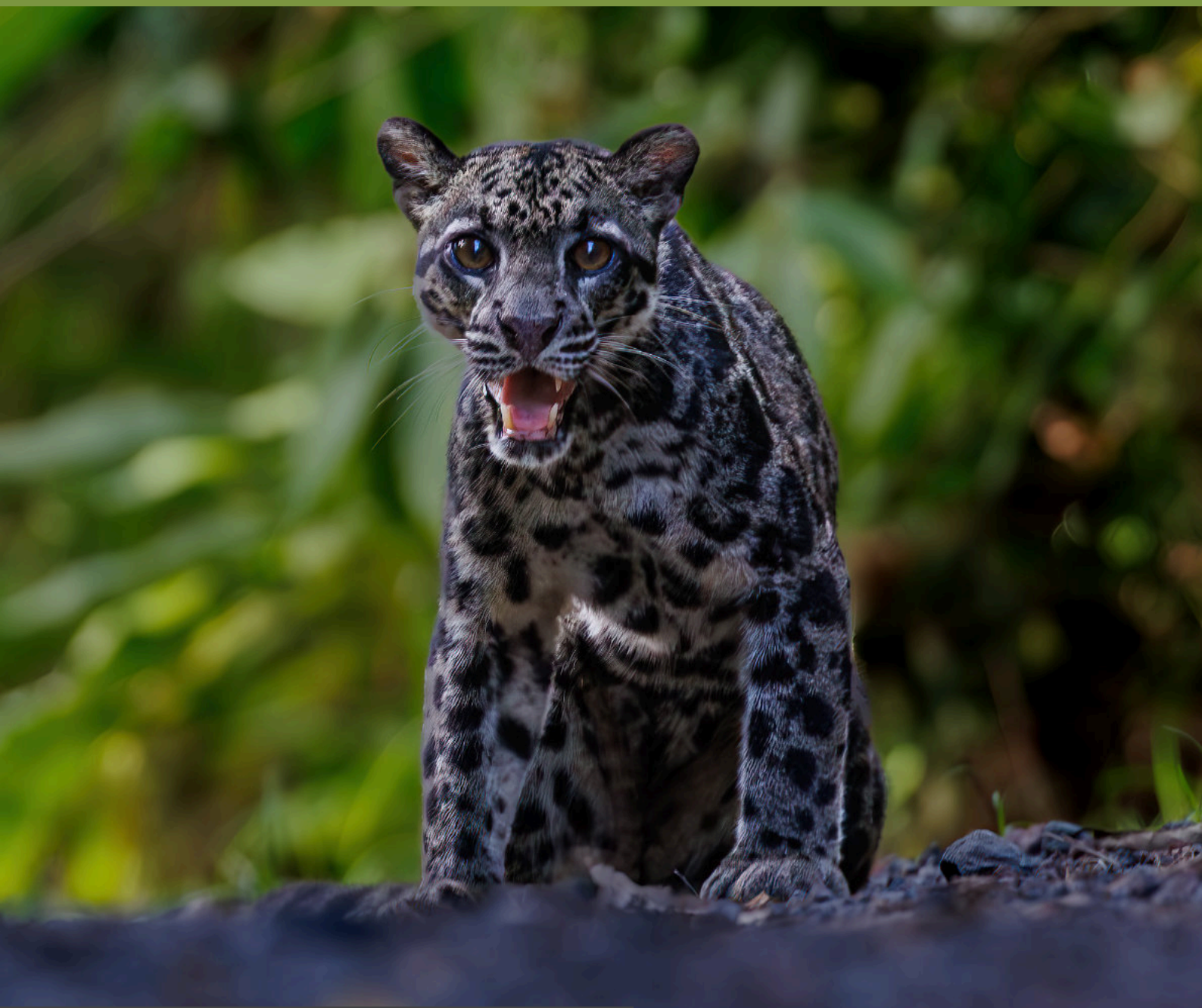
Sunda Clouded Leopard